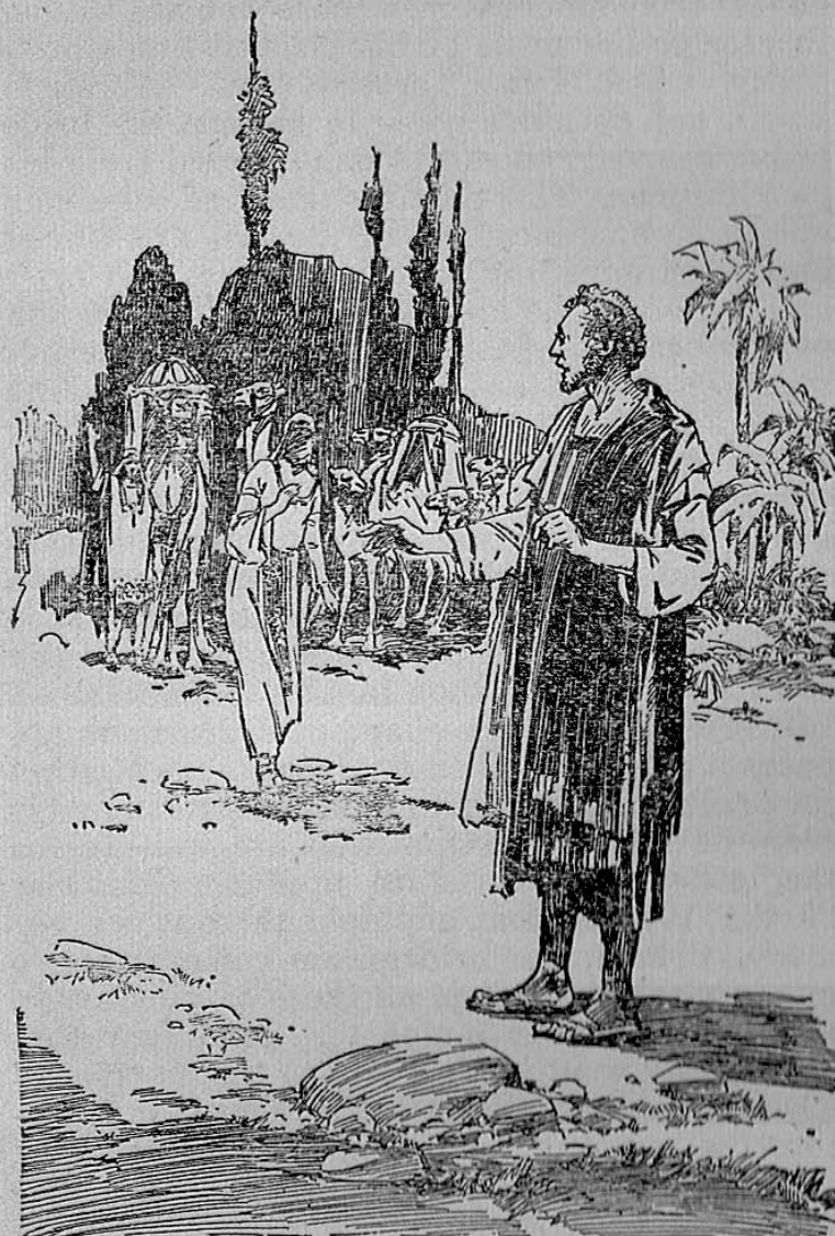
Type of the marriage of Christ and the bride

Abraham's sending his servant to select the wife for his beloved son Isaac pictured God's sending his holy spirit to earth to seek out and