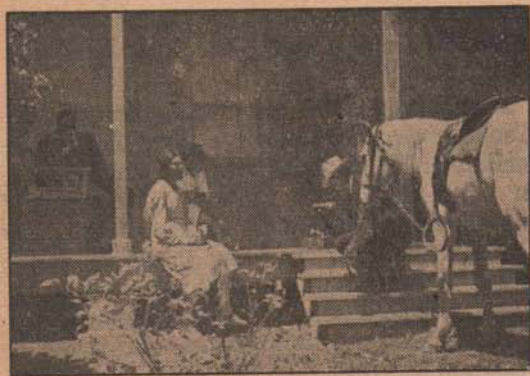
Pioneering in Napoleonville, La.