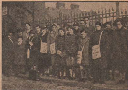
At Belfast, Eire, Assembly, March 23, 1941

◆ While we were calling on the clergymen with the booklet Theocracy , I met one who asked many questions, and I arranged to call back with the records. I took "Religion as a World Remedy". He