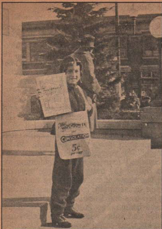
Ten-year-old New Britain, Conn., Theocracy publisher on duty at Bristol

witnesses in Colorado Springs may no longer be interfered with.