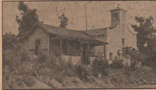
Demon fires break out without warning in this house next to the Catholic church at San Dimas, California.