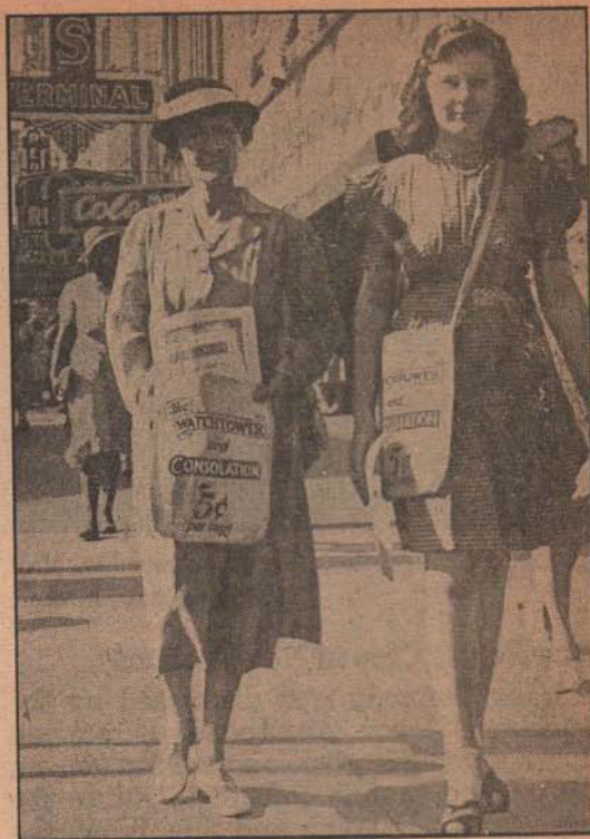
Theocracy magazine publishers, Knoxville, Tenn.

their powers into the field of opinion; that Jehovah's witnesses now stand in the same relation to the courts as did the apostles of old; that teaching and preaching the gospel is not a business required to be registered; that teachers and preachers distributing and selling books and pamphlets setting forth their beliefs are not peddlers; that it is not unlawful to go to a private residence to teach and to preach; that it is unlawful to demand fees for the sale of periodicals; that it is unlawful for a chief of the police to require that a permit be obtained from him before teaching and preaching from door to door may be done; that no municipality has the right to interfere with the free and unhampered distribution of pamphlets, and to essay to do so is to deny freedom of the press and freedom of speech, and must be restrained. The work of Jehovah's