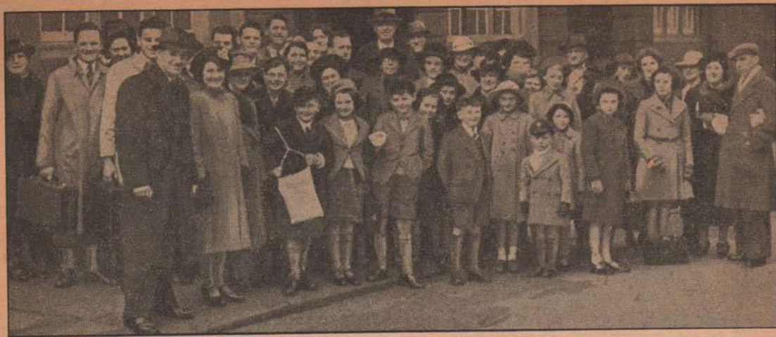
At the South Shields, England, Assembly, May 4, 1941, 38 turned out for immersion. This cheerful group is outside the baths, awaiting immersion.